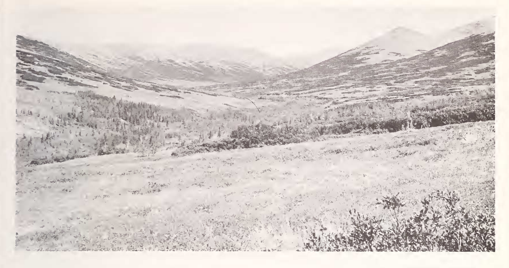
Fig. 4. Broken tracts of alder and willow as found throughout areas above timberline; upper Tuluksak River area, June 1974.

loides ), and resin birch ( Betula glandulosa ) form the understory of black spruce woodlands. Black spruce woodlands are largely confined to the extreme northeastern interior of the study area, although some persist southward near the western foothills. Forests are often low and open (Fig. 5), and growth is slow; white spruce rarely exceed heights of 18 m,